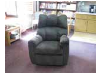
2nd Armchair & Recliner