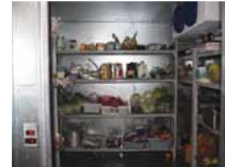
Shelving for Walk-in freezer

The alumni have currently donated the following items as illustrated here. Thank you for your support.