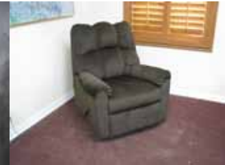
Armchair & Recliner